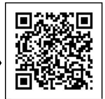
QR Code for Transportation

A bus will be leaving from the Star of the Sea Carpark at 5pm. Spaces are limited so get in quick. Cost of transport $10pp. Please book your place on the bus here: bit.ly/SOTSbus or by scanning the QR Code. If you have difficulty doing so, please see us at the entrance of the Church.